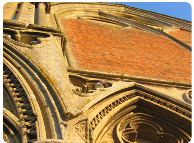
The beautiful architectural detailing and window tracery of the west front (1226-44) (Trevor Ashwin)

pieces of medieval architecture in Norfolk. The tracery in the window is some of the earliest in England, along with examples at Westminster Abbey. The entire west front was restored in 1987-90.