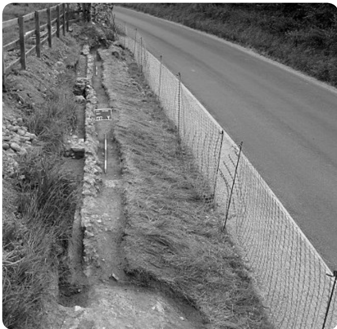
Area B. Foundations of the precinct wall (Scale 2m)

An excavation in 2007 along the line of the collapsed precinct wall, adjacent to the gatehouse, was designed to identify the original course. In 2008, excavations of areas associated with access to the new visitor building within the north aisle, and service trenches across the modern graveyard were carried out. Other works included the excavation of pits for four new interpretation panels within the ruins of the claustral ranges, and excavation within the gatehouse during road surfacing and path resurfacing to the church.