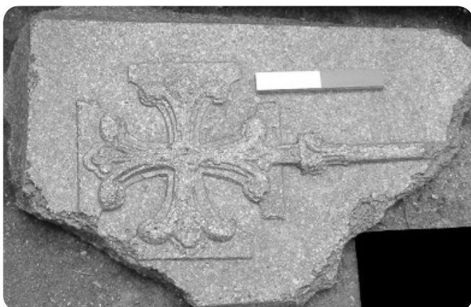
Purbeck Marble grave slab (Scale 10cm)