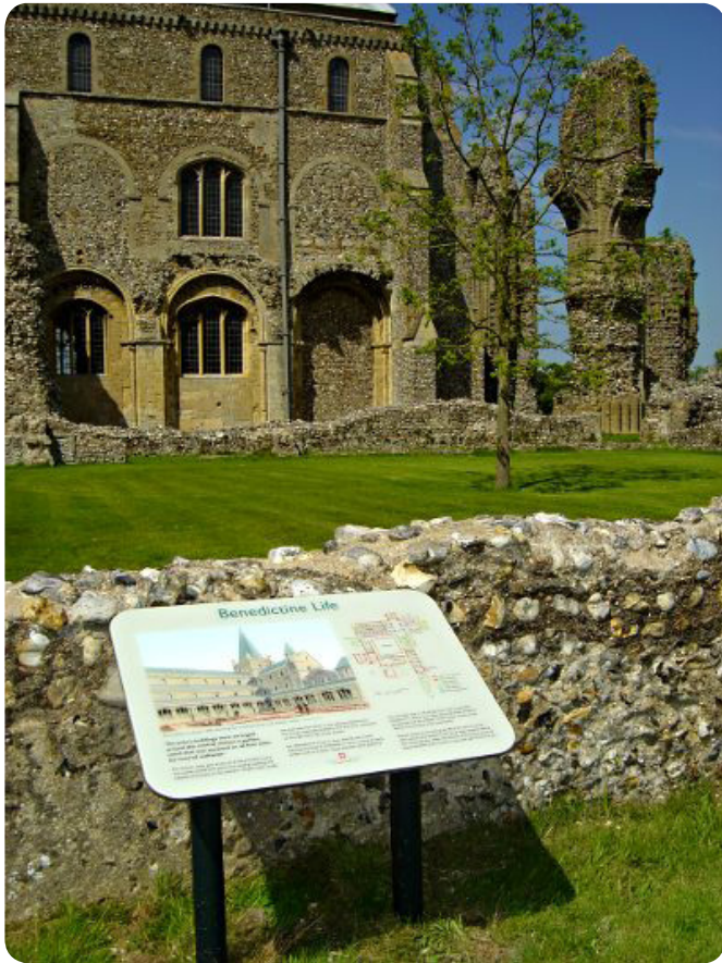
The cloister today. (Trevor Ashwin)

quarrelled with the village and with the Priory's 'mother house', the Abbey of St Albans. One dispute with the Abbot of St Albans in 1212 led to a full-scale siege. In 1335 a prior had to flee after investing the Priory's wealth in alchemy experiments. In the 14th century there may have been as many as 14 monks but their number then declined, as did the Priory's income.