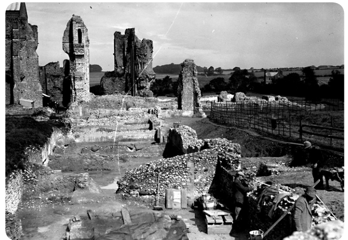
Clearance work in progress in 1936

On the south side of the cloisters was the refectory (dining room), with kitchens behind. To the west lay storerooms and accommodation for the prior and his guests. Traces of other unexcavated structures spread out into the surrounding meadow beyond the area excavated in the 1930s. Although thorough, the 1930s excavation was not conducted to modern standards, and huge amounts of rubble were shovelled away en masse to expose the medieval plan.