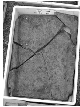
A complete tegula found this year at Whitehall Farm Villa

the wider circle of local rural settlement. Our test pitting in the copse to the west of the Manshead field proved that occupational activity extended some way from the core of the town although it was difficult to ascertain the nature of that activity. The highlight of this autumn's work will be a fieldwalking survey of Manshead field and further geophysical survey in this important southern extension of the town.